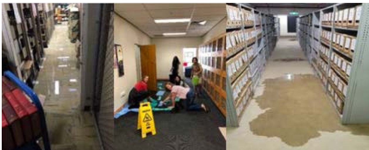
And the water flows in... and our wonderful staff again show resilience and good humour in dealing with challenges