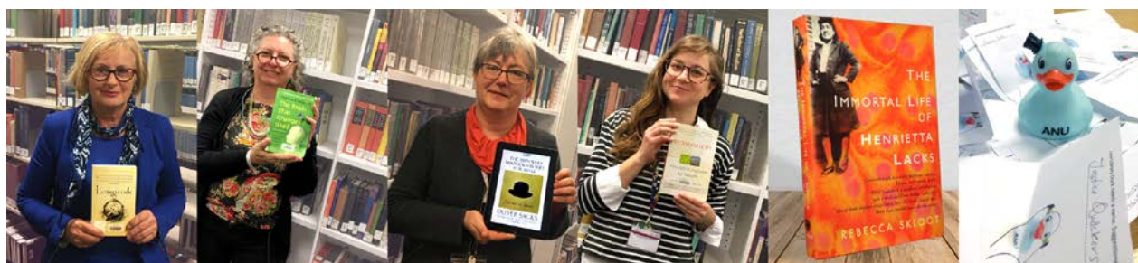
Hancock Library staff with their top book selections. Right: Obiter ducktum all dressed up in duck tails for the announcement.