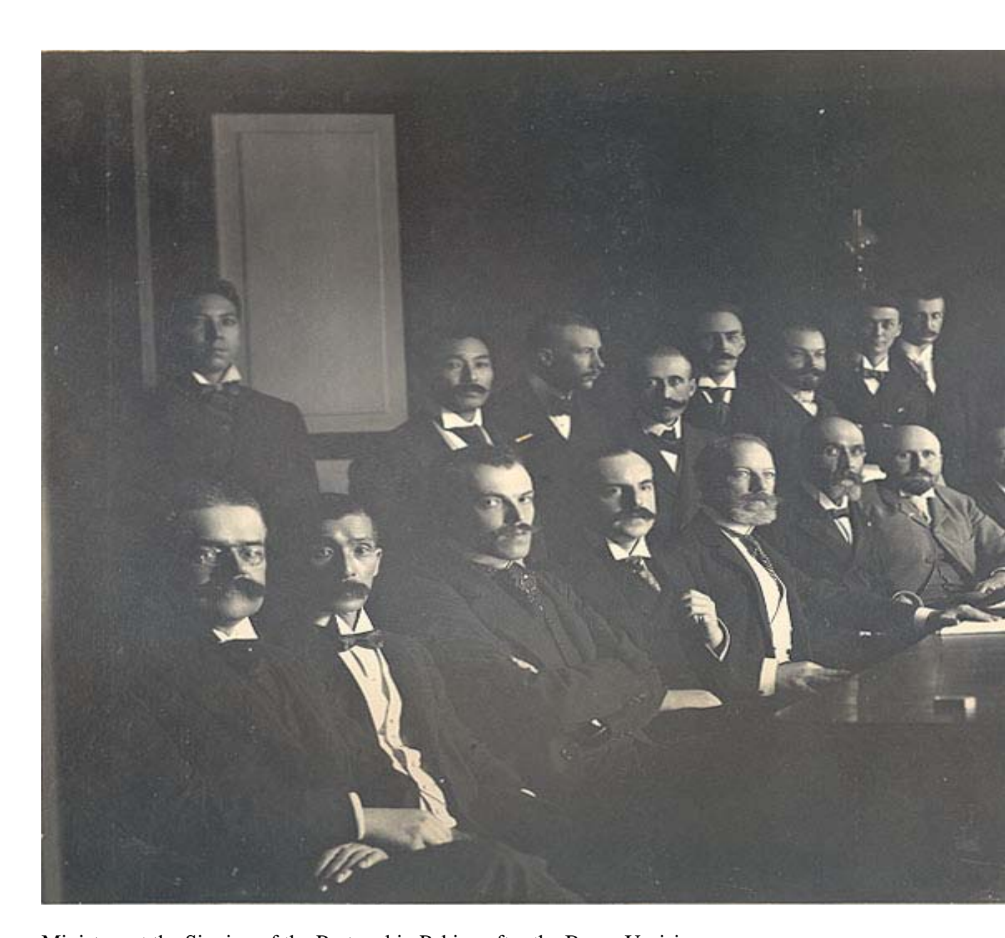
Ministers at the Signing of the Protocol in Peking after the Boxer Uprising