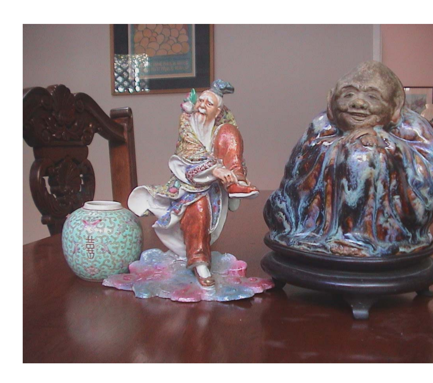
A vase, a foolish old man and a wise old man, now in the possession of my daughter Kylie Gass