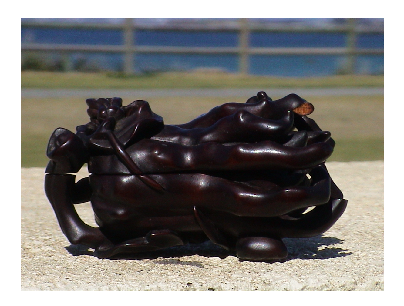
2. A carved fruitwood box of a finger-like lotus root form (Guangxu 1875, length 10 cm.). It has travelled around the world many times and has unfortunately sustained some breaks. But it is still a thing of beauty.